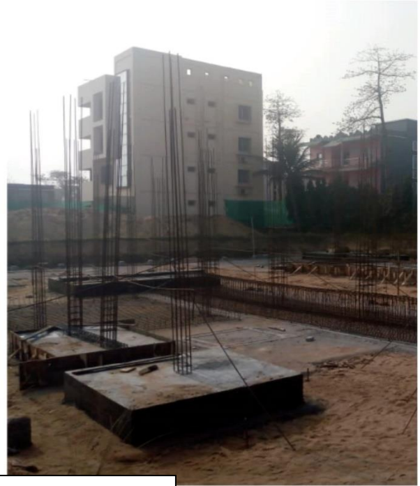
Construction of Multipurpose Building in DSDI is in progress