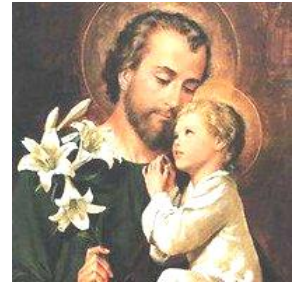
(St. Joseph's Feast Day March 19)

Pope Francis: "I love St Joseph very much because he is a strong and silent man"